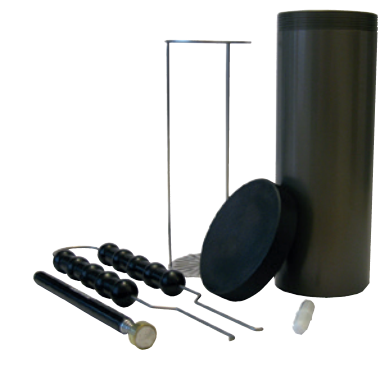
Insert for liquids with accessories

Temperature micro calibration baths Fig. left: model CTB9100-165 Fig. right: model CTB9100-225